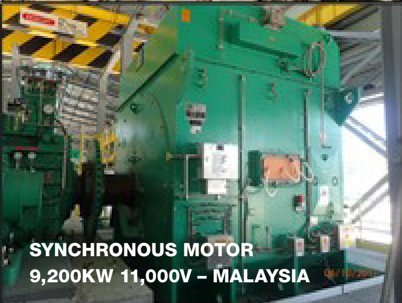
SYNCHRONOUS MOTOR 9,200KW 11,000V – MALAYSIA