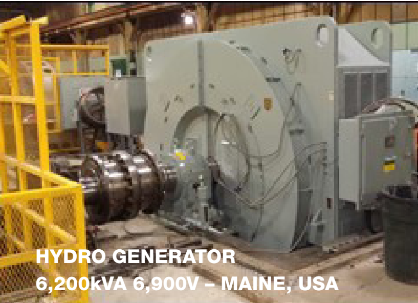
HYDRO GENERATOR 6,200kVA 6,900V – MAINE, USA

We offer a high-level quality technical support for the aftersales demands, covered by our qualified team based in our main office in Duluth, GA, and on-site assistance with our team of field service engineers based in the USA and overseas.