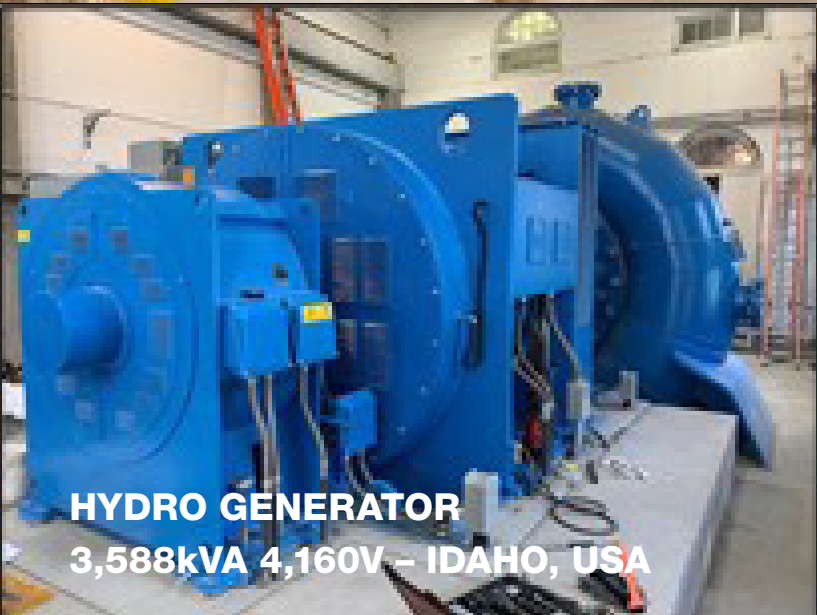
HYDRO GENERATOR 3,588kVA 4,160V – IDAHO, USA