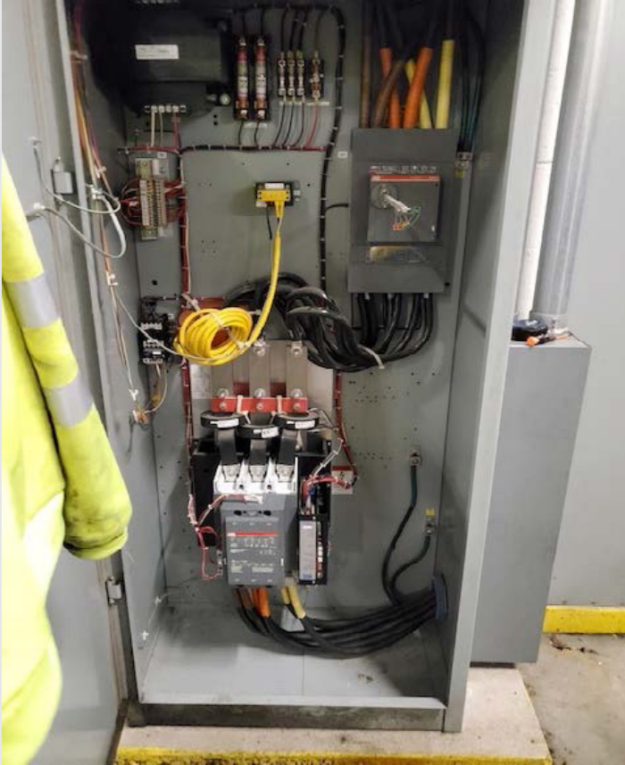
Original RAM 400 HP Solid State Starter