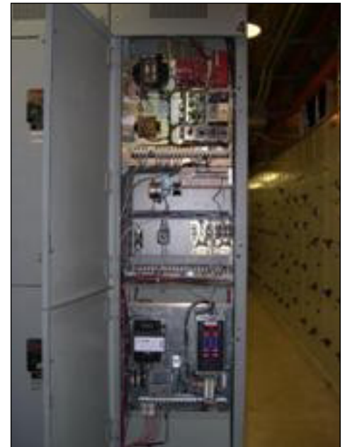
Regutron™ III Installed in Existing Panel