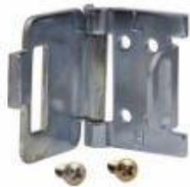
Lock On/Off Padlocks