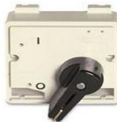
Direct Mount Handles