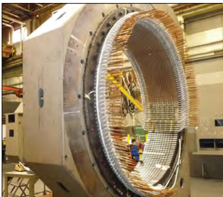
Generator stator winding in process