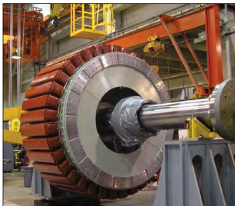
Rotor assembly for 200 rpm vertical generator