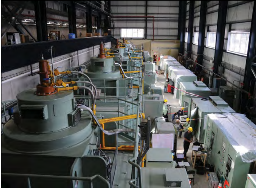
Vertical Synchronous Generators with TEWAC Enclosures

Custom built for various turbine applications, durable WEG Electric Machinery, WEM, generators can be designed to meet individual arrangement requirements.