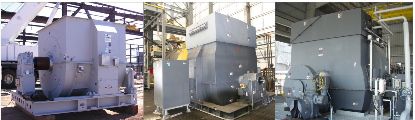
Available for Engine, Pedestal and Bracket Type Configurations