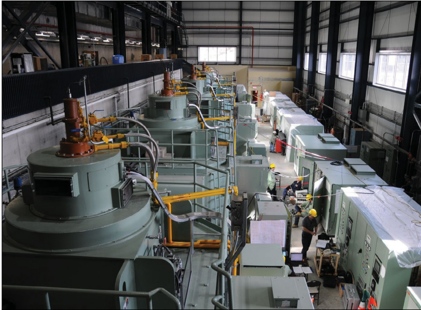
Vertical Synchronous Generators with TEWAC Enclosures

Custom built for various turbine applications, durable WEG Electric Machinery, WEM, generators can be designed to meet individual arrangement requirements.