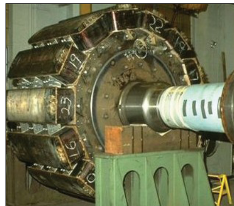
Shop assembly of rotor for horizontal generator rated 18 MW 514 rpm