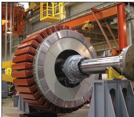
Rotor assembly for 200 rpm vertical generator