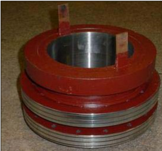
Turbo Generator Replacement