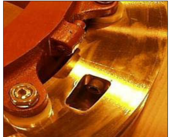
Split Rings use Pocketed Design