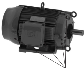
Drain plugs positions