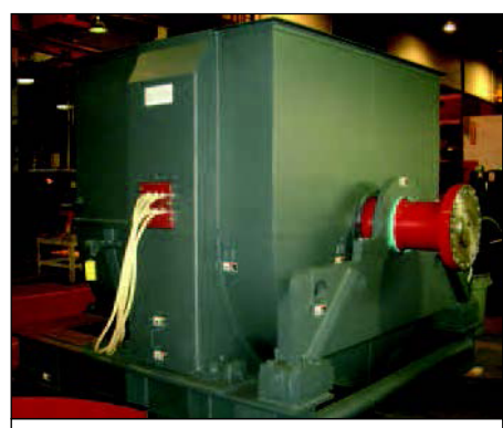
Base Plate with Shipping Cradle on Flanged End