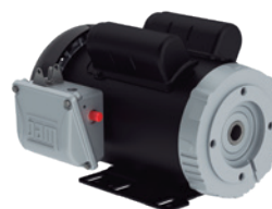
SAE A (Frames 48 to 213/5T)