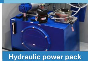
Hydraulic power pack