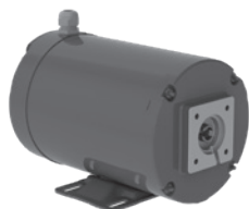
NEMA 4F-17 (Frames 42 to 56)