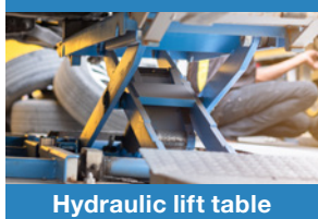
Hydraulic lift table

WEG counts on wide range of motors specially designed for application on hydraulic pumps. Contact us.