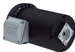
SAE A-A (Frames 48 and 56)