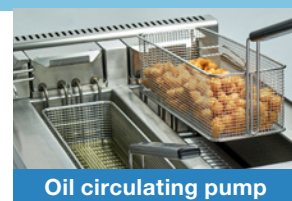
Oil circulating pump