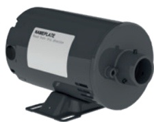
Hub Mount (Frame 48)