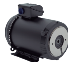
SAE B (Frame 254/6T)