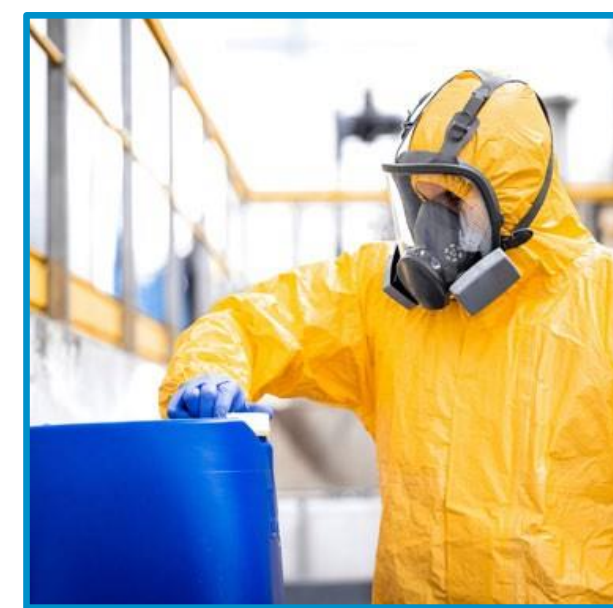
Recovered solvent returning to the process