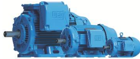
W22 Cast Iron